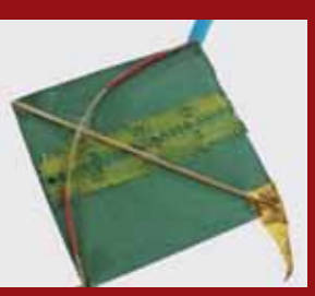
Class 2 - Kite making done by Daksh Nakar