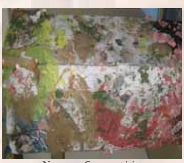
Nursery - Group activity -Painting done on the tunnel