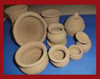
Class 2 - Group activity - Pot making