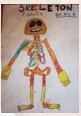
Sr.Kg - Drawing and colouring of Skeleton done by Ramita Jain