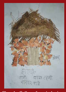
Class 1 - Collage from indeginous material done by Aryan Bhandari