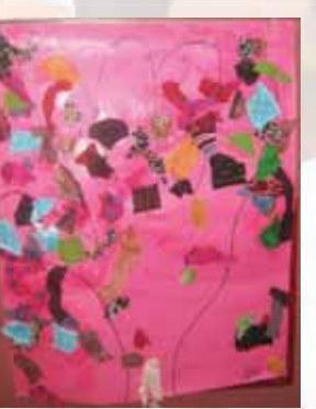
Nursery - Cloth pasting