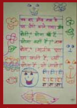
Class 5 - Hindi Poem written by Yash Pandya