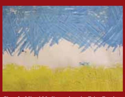
Class 3 - Mixed Media art done by Priya Pandya