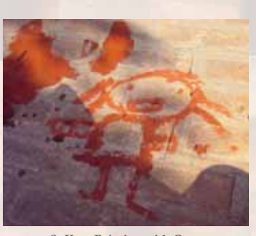
Sr.Kg. - Painting with Geru