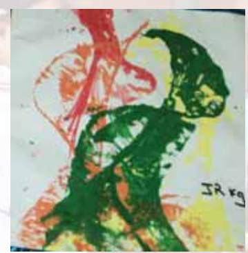
Jr.Kg - Group activity - Thread Painting