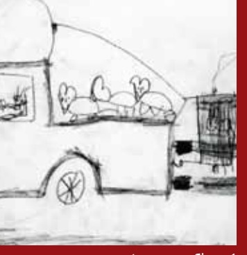
Armaan - Class 1