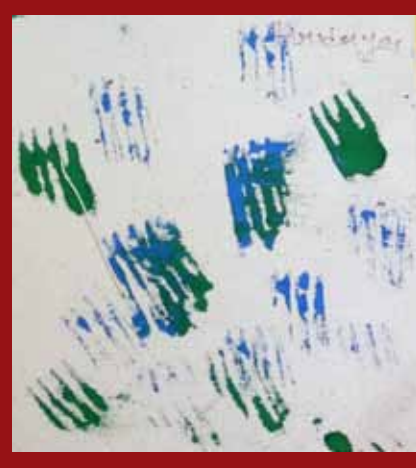
Hridiya Acharya | EYP 2 D