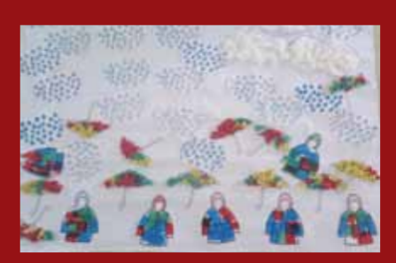
Monsoon Collage | Junior Kg. A