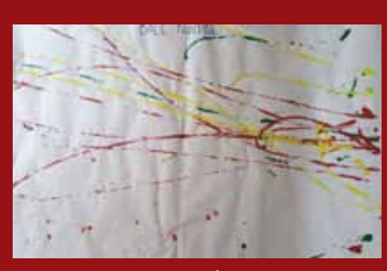
Ball Painting | EYP 2 B