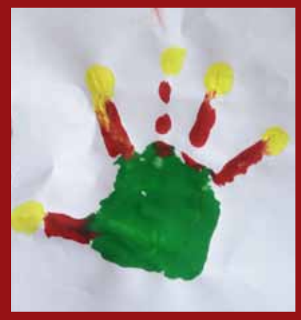
Vansh Nahata | EYP 2 C